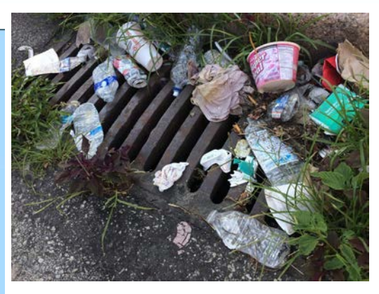
Litter clogs stormwater drains which leads to flooded culverts!