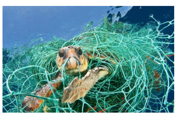
Marine Debris entangles ocean and bay wildlife!

Balloon-related litter makes up 40% of marine debris, beverage bottles plastic accounts for 22%, and fishing and aquaculture gear accounts for 12%.