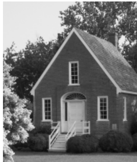
The Eastern Shore Heritage Trail includes historic, scenic and natural attractions