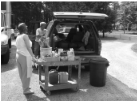
Household Hazardous Waste Disposal at ESO Arts Center

The Committee's consultant also monitored ground water quality data. Although most of the permitted facilities on the Eastern Shore do not show evidence of saltwater intrusion, some facilities have elevated chloride concentrations although the cause of this is unknown. The facilities are Eastern Shore Seafood, NASA Wallops Island, and YMCA Campground at Silver Beach. There is saltwater intrusion in the Town of Cape Charles, as predicted by the Town's Withdrawal Permit work.